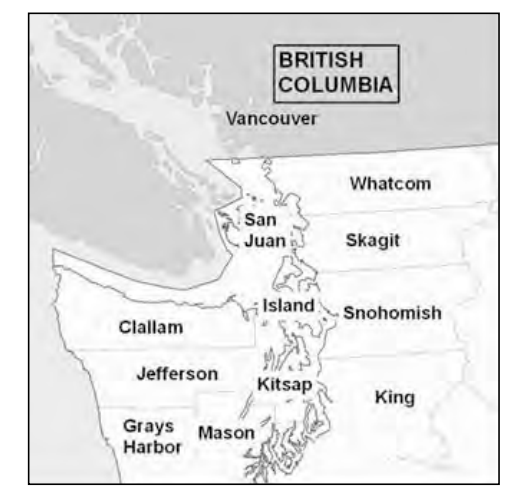
Figure 2. A schematic of county boundaries in northwestern Washington State.

During the winter months (October-February) of 2001–2006, telemetry surveys were conducted each day and night to document locations of marked individuals. Population surveys were also conducted semi-weekly from November to January to obtain additional detail on population movements and to validate telemetry data. The locations of collared swans were used to identify forage areas and roost sites. Telemetry data for swans that died from lead poisoning after radio-collaring were used to identify and prioritize areas for lead shot density as-